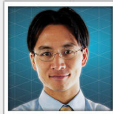
35 years old IT Manager for Swift Bank